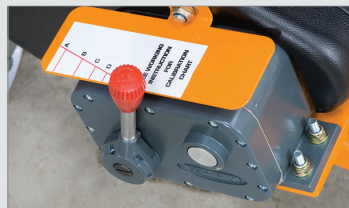
Zero Max Box for variable seed rates