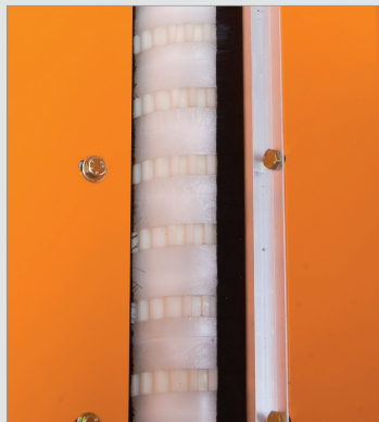
Grooved discharge roller – two discharge roller options for pure bent, rye grass/fescues