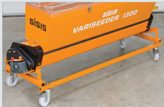
Transport trolley – storage trolley for ease of movement in the shed/workshop