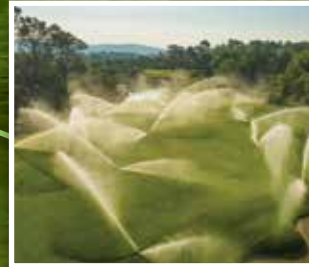
Lynx Smart Hub In Action