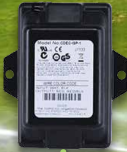
Lynx GDC Decoder