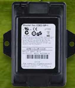
Lynx GDC Decoder

Operate sprinklers right from the Smart Hub pedestal, with the sprinklers in view on the course. No need to radio or return to the office.