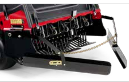
WINDROW KIT Steel deflectors direct cores into neat, narrow rows for easy collection and removal.

illumination. Lights are strategically mounted