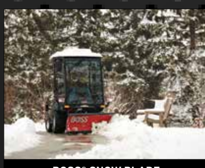
BOSS® SNOW BLADE