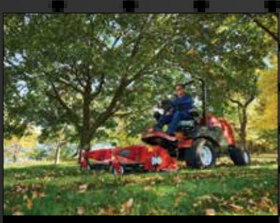
FLAIL CUTTING DECK